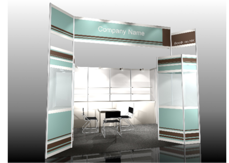
COLOUR PERSPECTIVE N.T.S

Glass showcase with white wooden swing door (1000mmW x 500mmD x 2500mmH) with 2x 50W halogen downlight)